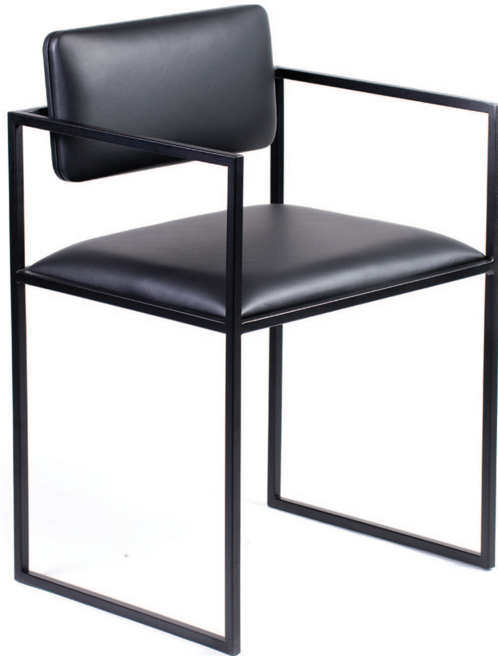
Albert Dining Chair