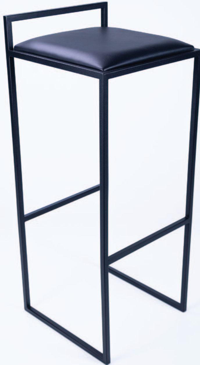
Albert Bar Stool