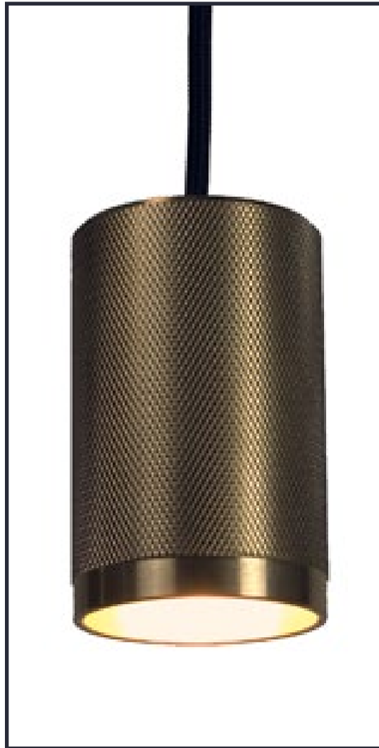
Aged Bronze (BO)