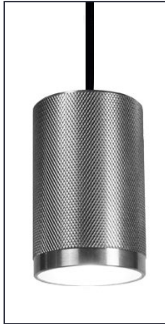
Stainless Steel (SS)