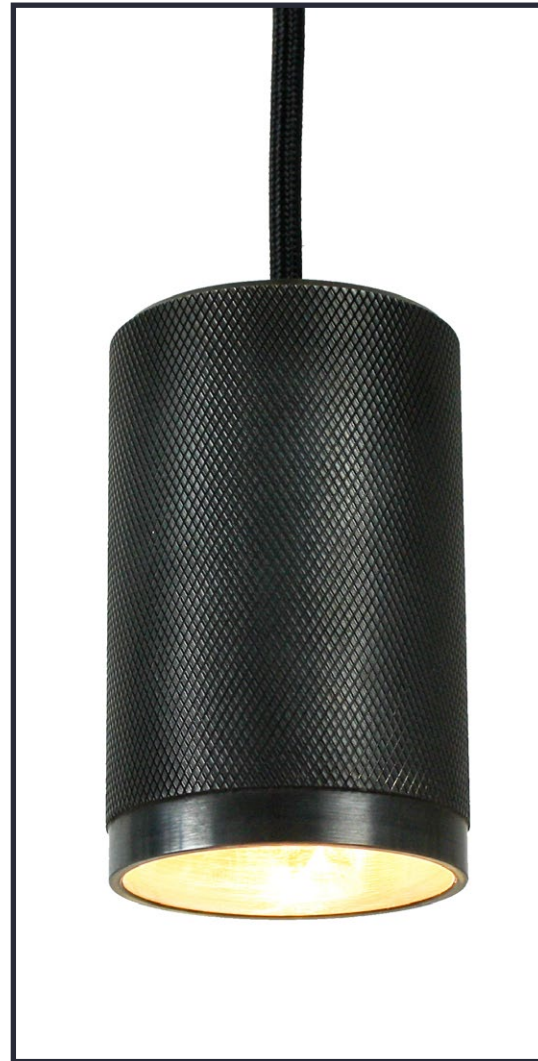
Blackened Brass (BB)