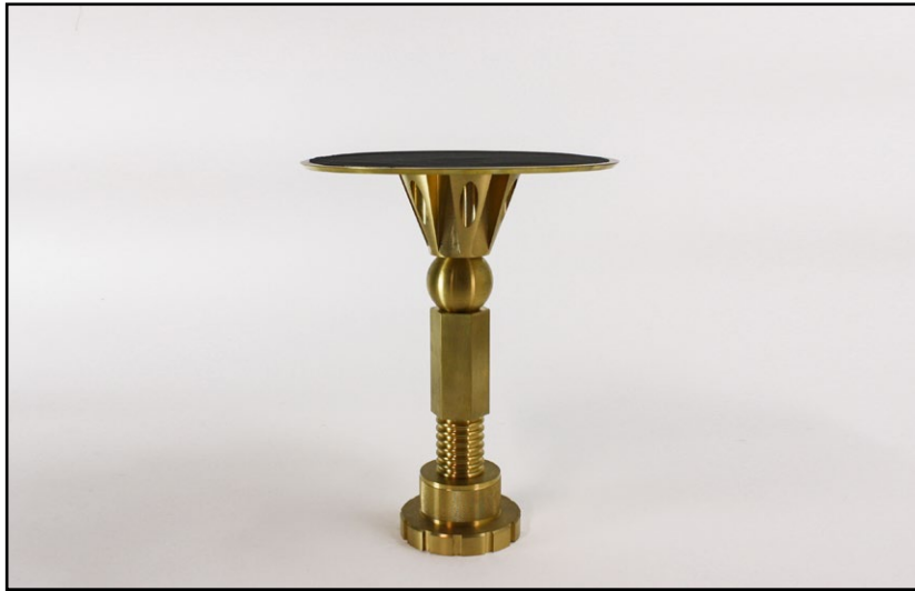
Scotty Side Table Brass (BR)