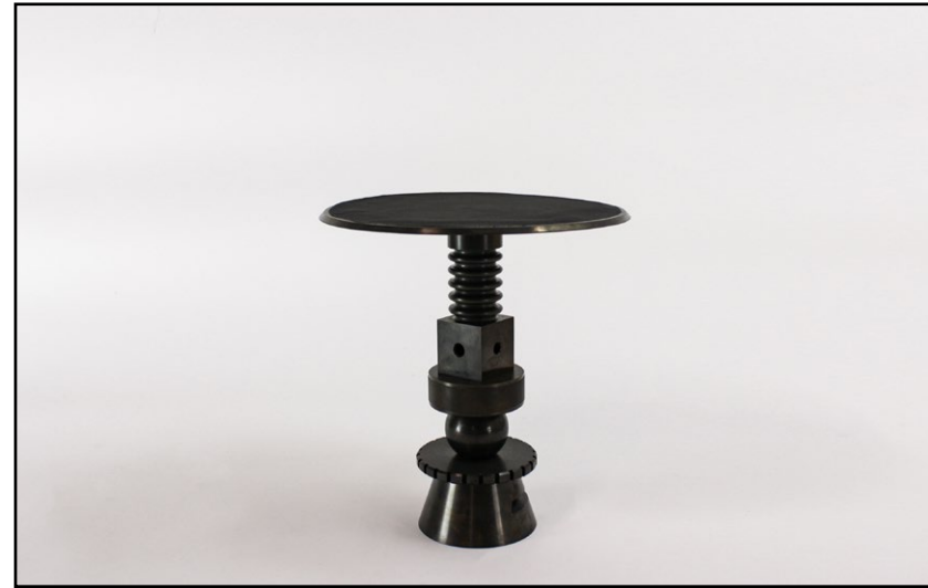
Kath Side Table Blackened Brass (BB)